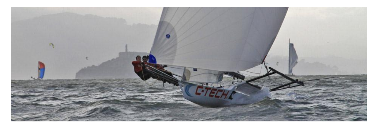
New Zealand's C-Tech clinched title as first 18 Skiff to finish Ronstan Bridge to Bridge