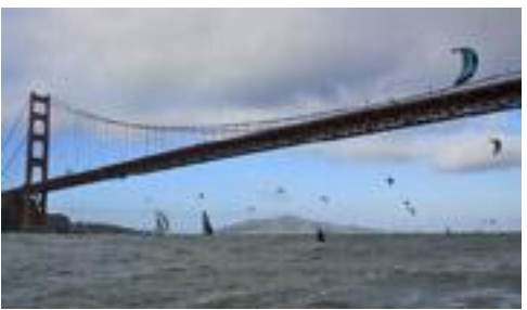
Sails galore for the start