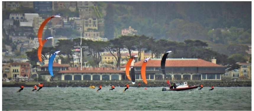
The first official start of the 2021 season at TNKS